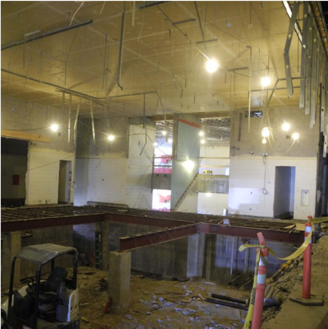
Partial Demolition of Interior Second Floor