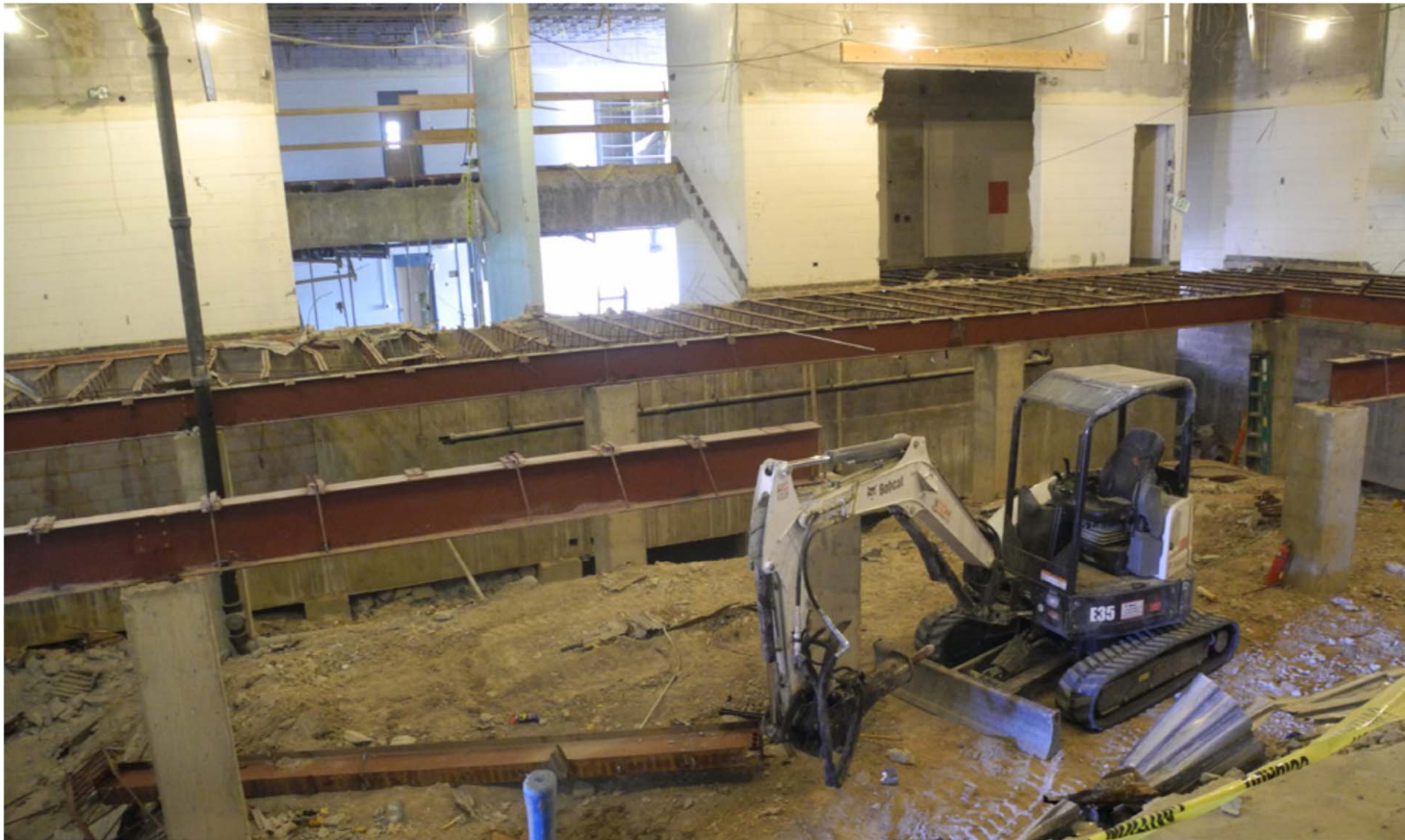
Partial Demolition of Interior Second Floor