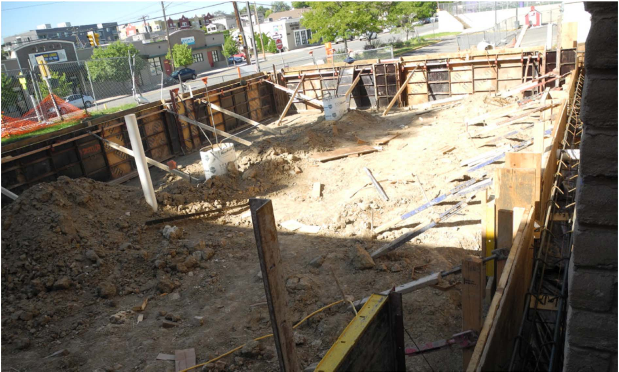
Foundation for Cafetorium Addition