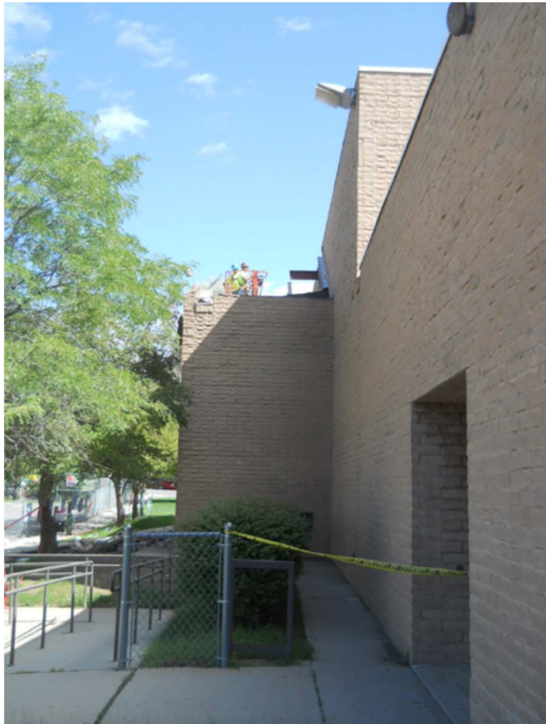
Demolition of Stair Tower Beginning