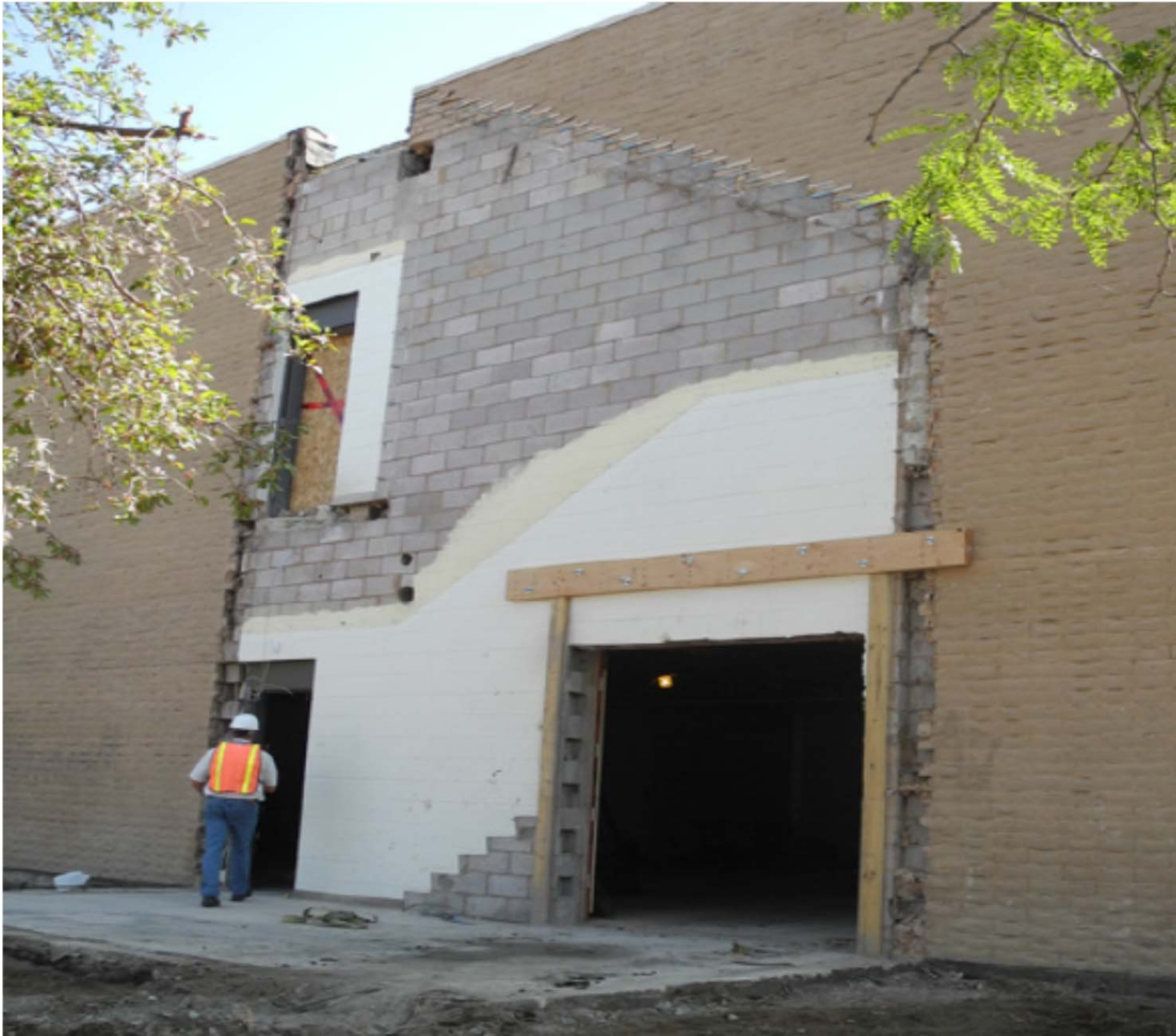
Exterior Wall After Removal of Stair Tower