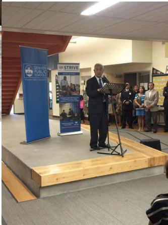
Ruben Valdez Campus